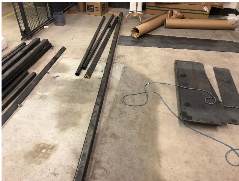
Metal rods, legs and sheets for SLP base