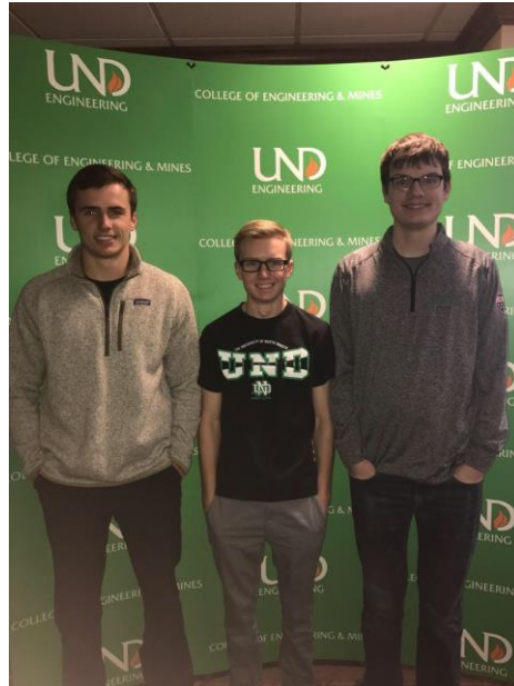
ME working on centralizer meet to discuss progression