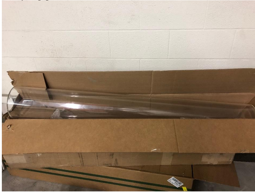
8'' OD acrylic pipe 5' section