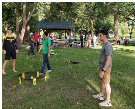
SPE Picnic at University Park