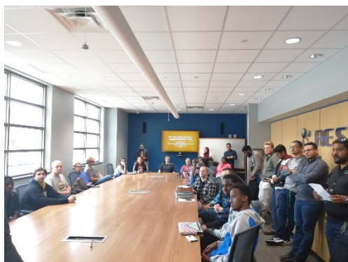
Lunch and Learn session