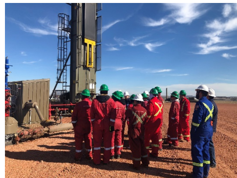
On site with Oasis