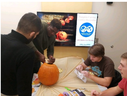
Pumpkin carving and cookie decorating