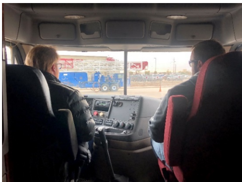
Driving a tractor trailer at TrainND