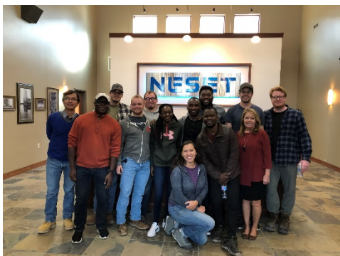
Tour of Neset Consulting